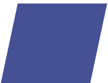
RAL 5002 Blue