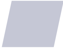
RAL 9006 Silver