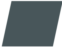
RAL 7015 Dark Grey