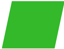
RAL 6024 Green