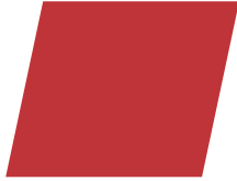
RAL 3020 Red