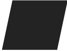
RAL 9005 Black